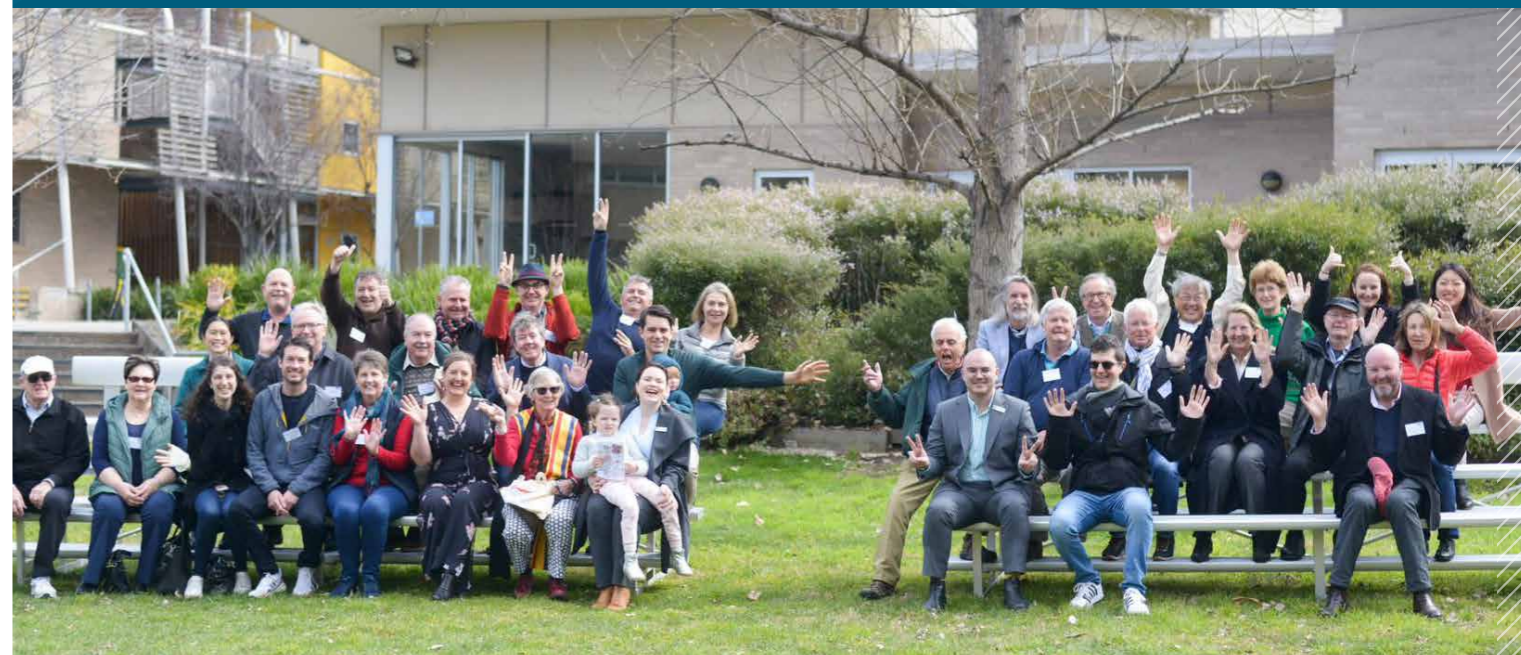
▲ Group photo of alumni at our 50th Anniversary Back to Burg Weekend in 2022.