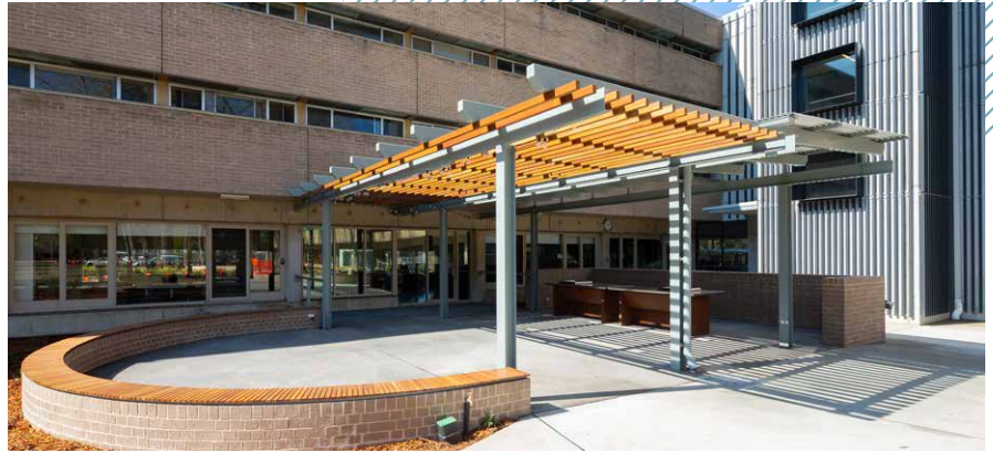
▲ The Undergraduate Courtyard features more seating, an upgraded BBQ, and direct access to the Common Room.

The Courtyard Redevelopment Project has been years in the making and was made possible through the generosity of many donors to our annual fundraising appeal during the College's 50th Anniversary year.