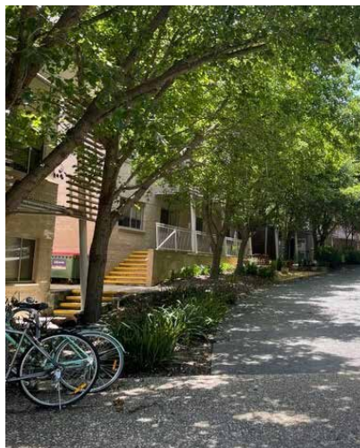
▲ The Burgmann Postgraduate Village.