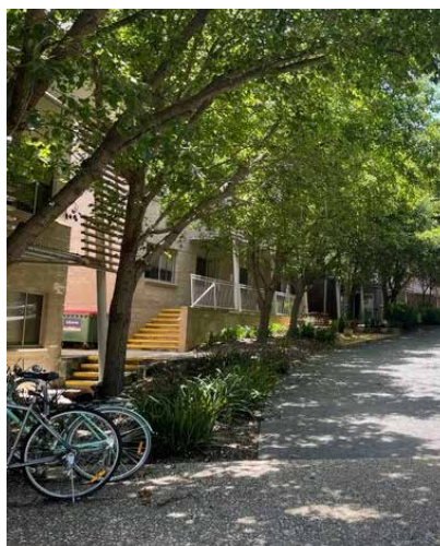
▲ The Burgmann Postgraduate Village.