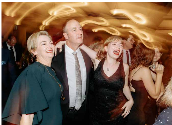
▲ Top: Families enjoyed dancing to the Burgmann Band's performance.