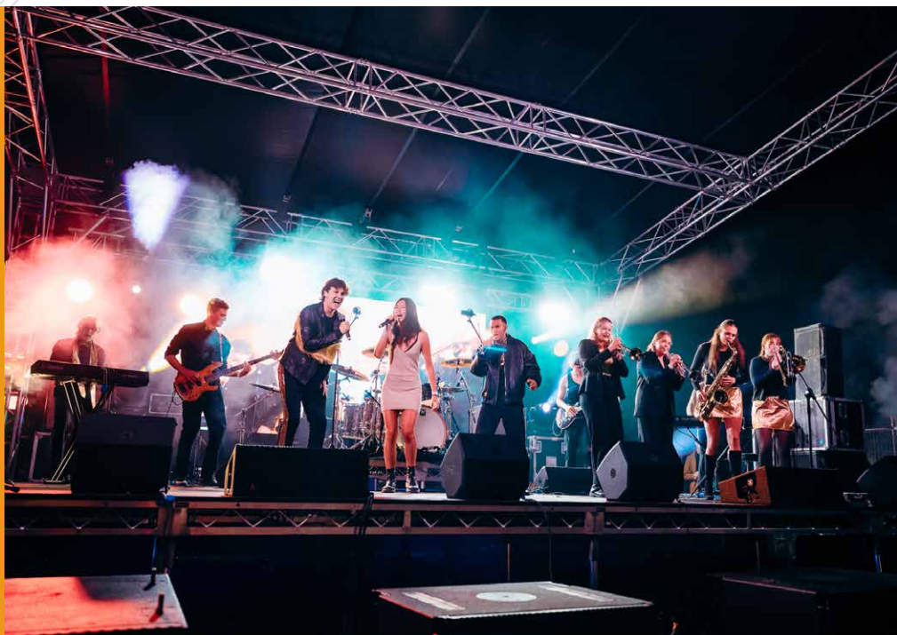
▲ The Burgmann band performing during BNO.