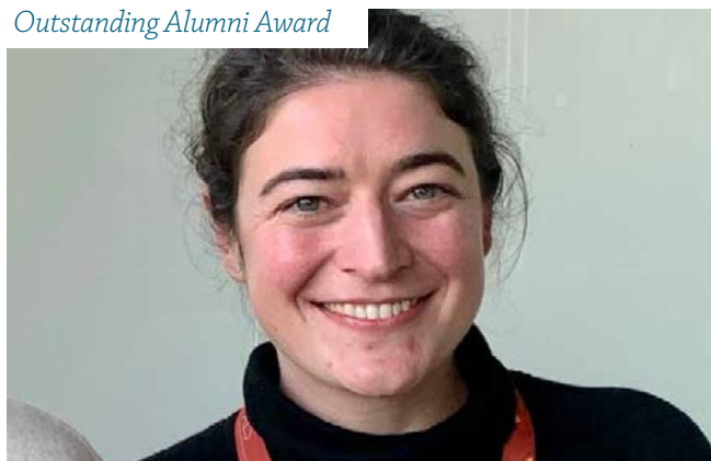
Outstanding Alumni Award

“[Working at the Aboriginal Legal Service] was a really special experience. I always felt very privileged to be trusted by people to act for them and for them to share so much of themselves with me.”