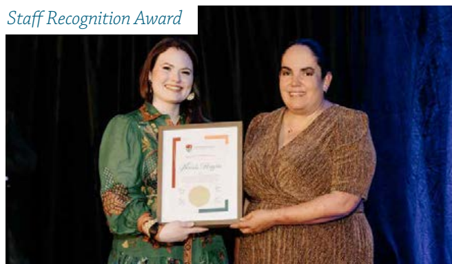
Staff Recognition Award

“The most rewarding part of my role is being part of the Scholarship and Bursary Committee. Seeing the benefits of the donations going to residents who can reduce their financial distress and not have to work three jobs to support themselves is incredible.”