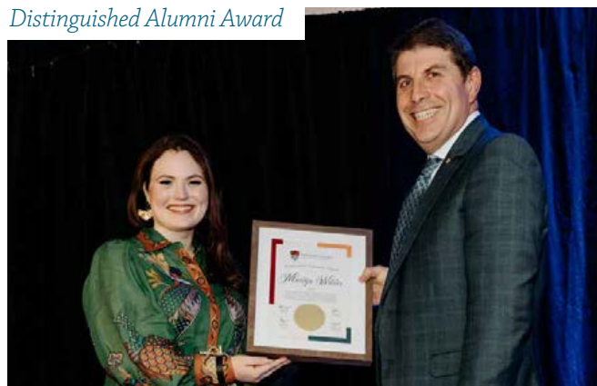
Distinguished Alumni Award

“What’s really important is, as best you can, try to make a difference and try to make a contribution to public life. And, at the same time, just be kind to people along the way.”