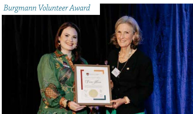
Burgmann Volunteer Award

“It is both enjoyable and fulfilling to give unwavering service to a beautiful and generous community where every person feels valued and cherished.”