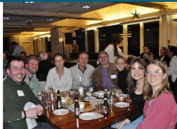
▲ Alumni catching up at the 2023 Trivia Night and Monsterbrain Challenge

You can see more photos from the event here