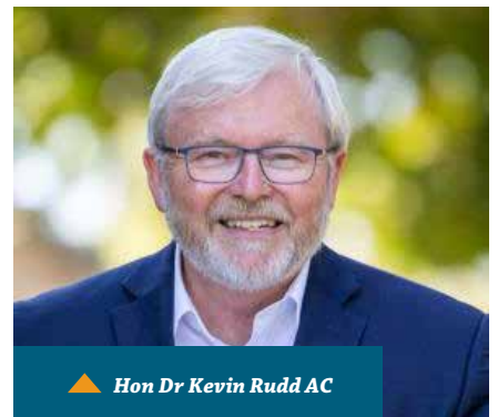
▲ Hon Dr Kevin Rudd AC

On 19 April 2023, Burgmann alumnus Hon Dr Kevin Rudd AC (1976–1977) presented his credentials to President Joe Biden and officially began his term as Australia's 23rd ambassador to the US.