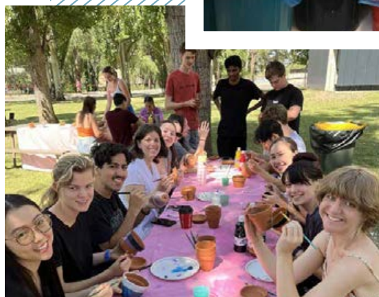
▲ Residents at the Paint & Plant organised by the Green Committee