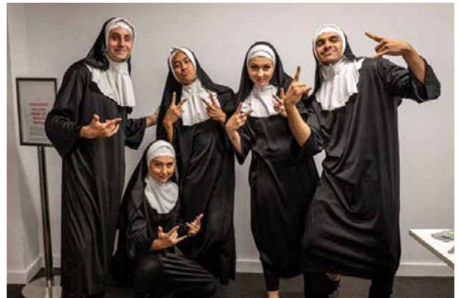
▲ The Leaping Nuns of Norwich getting ready for their gravity-defying performance at Commencement