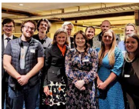
▲ Attendees at the 2023 Melbourne Alumni Get-Together