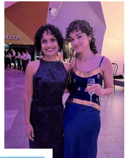
▲ Family Weekend attendees at the BRA Cocktail Party in the National Museum of Australia