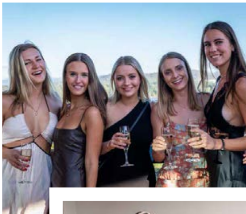
◀ Residents and guests enjoying Commencement at the National Arboretum, Canberra